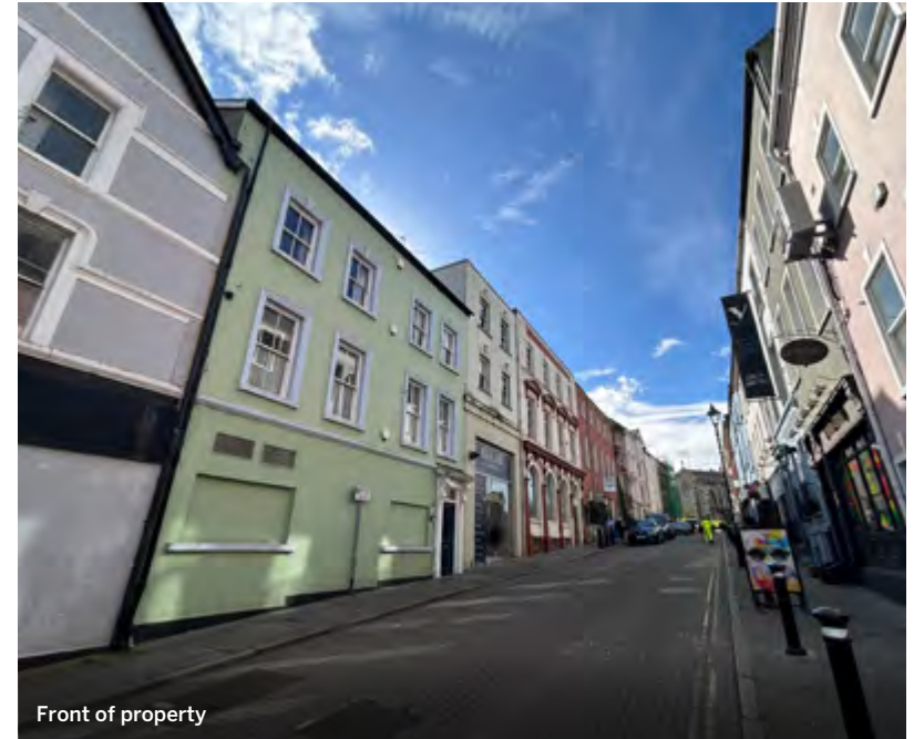
Front of property