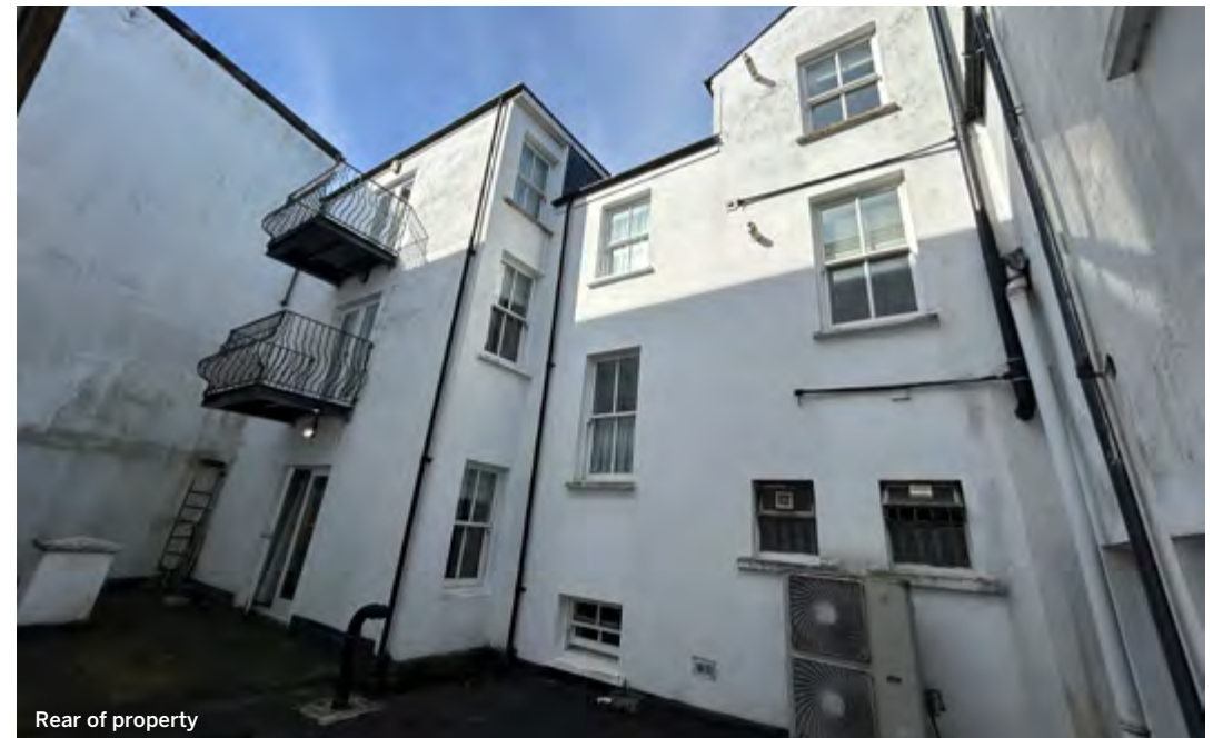
Rear of property