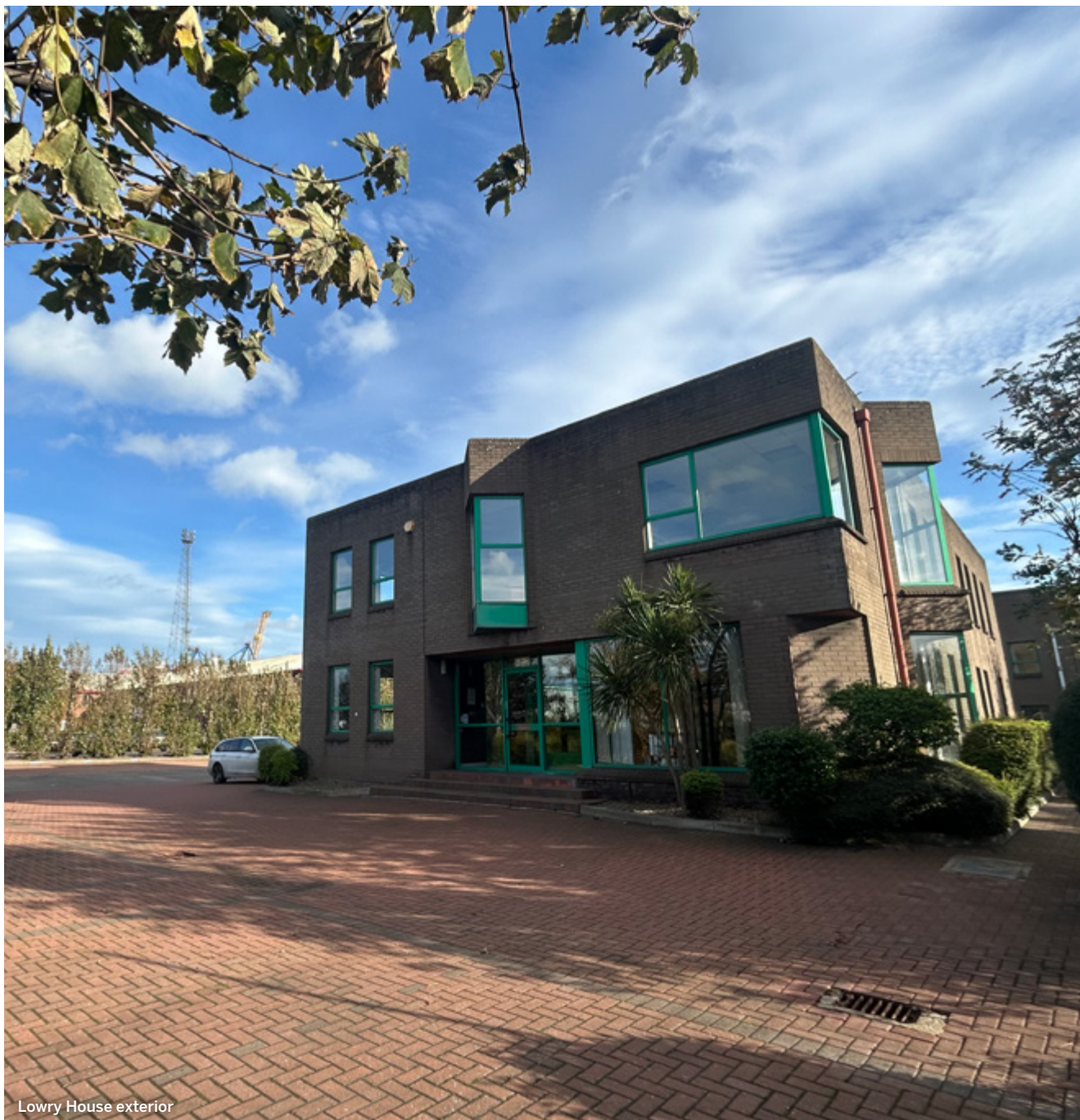
Lowry House exterior