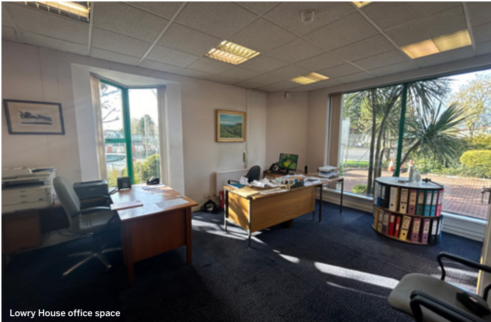
Lowry House office space