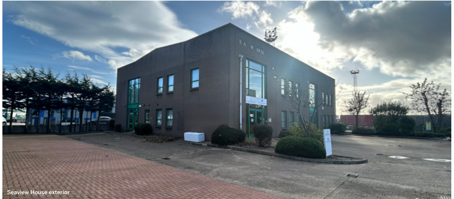
Seaview House exterior

Each suite comprises both open plan and cellular office space with kitchen and bathrooms. The property requires refurbishment throughout.