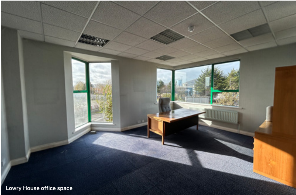
Lowry House office space