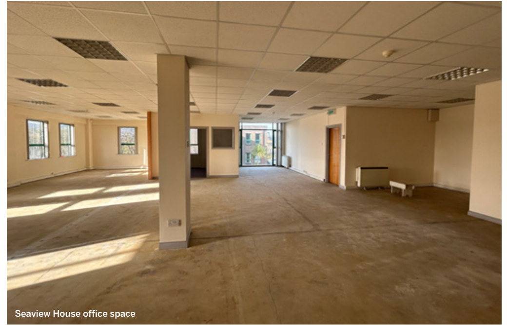
Seaview House office space