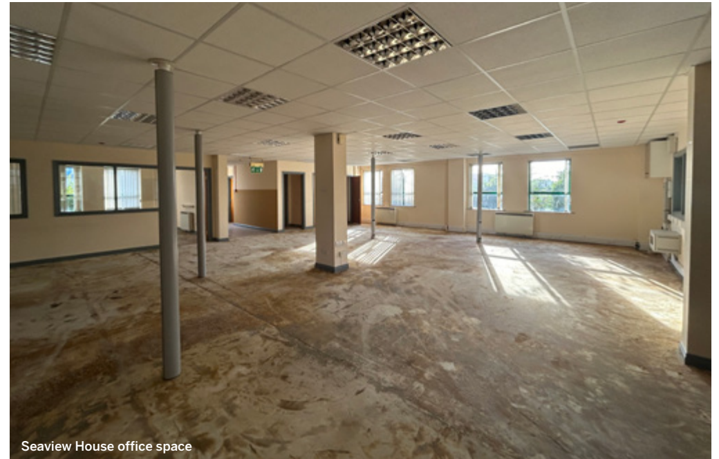
Seaview House office space