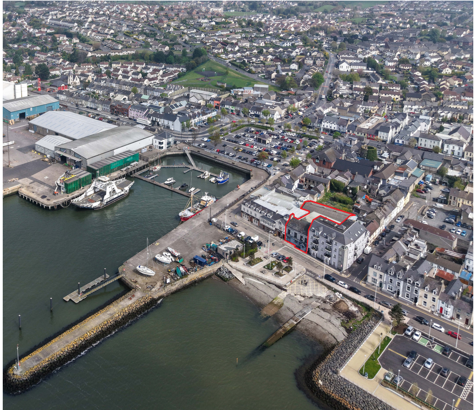
Property outline for indicative purposes only

Under NI Small Business Rate Relief, business properties with a NAV of more than £5,000 but not more than £15,000 should receive a 20% rate relief.