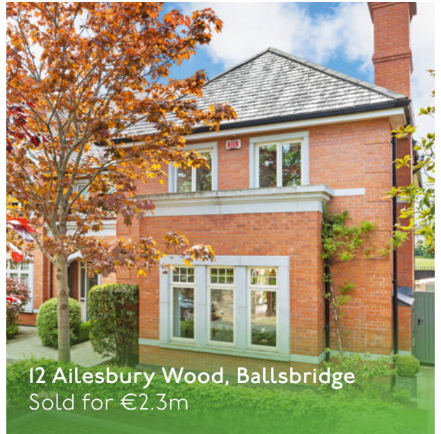
12 Ailesbury Wood, Ballsbridge Sold for €2.3m

9 RTB data shows that upward pressure on rents remain strong. Average rents across Dublin grew 7.8% annually in Q1 to €1,643. Strongest increases were in Dublin II (10.7%) and Dublin 6 (10.2%), while the weakest increases were in Dublin 6W (2.9%) and Dublin 18 (4.5%). At the end of March 2019 the average monthly rent of a two-bed apartment in Dublin was €1,605 rising to a high of €2,169 in Dublin 2. The average three-bed semi-detached house rented at €1,576, rising to €2,921 in Dublin 4.