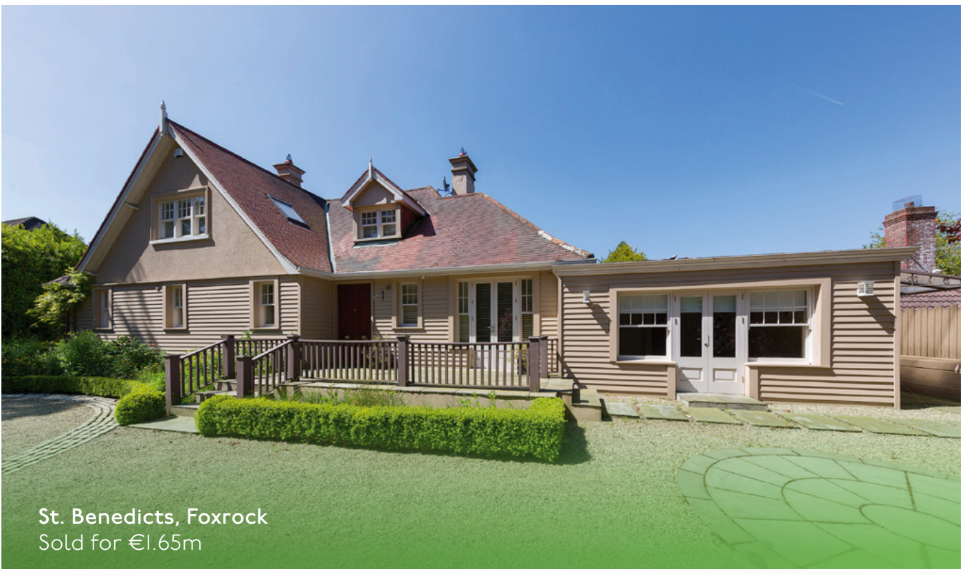
St. Benedicts, Foxrock Sold for €1.65m

6 Based on Lisney sales data in the first half of 2019, two-thirds of our purchasers were either trading up (32%) or were first-time-buyers (34%). It was notable that investor activity was weaker with just 16% of our purchasers buying an investment property. Single property landlords have become a less prominent feature of the market as they face greater costs pressures, in addition to uncertainty in securing vacant possession in the future. Institutional investors have been much more active in providing rental accommodation with construction of PRS schemes making a welcome addition to the rental supply in Dublin.