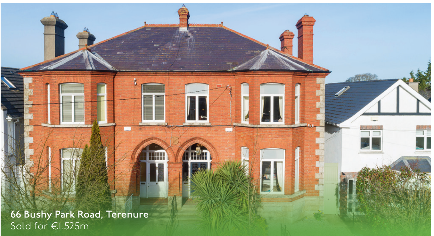
66 Bushy Park Road, Terenure Sold for €1.525m

10 Various measures included in the Residential Tenancies (Amendment) Act 2019 came into effect in June and July with others to follow. These provide greater protection for tenants with termination notice periods extended; a requirement to offer properties back to previous tenants if works have been carried out or if the property becomes available to rent again after a sale; changes to exempted properties in rent pressure zones; an extension of rent pressure zones until the end of 2021; and new prescribed rent review notice forms.