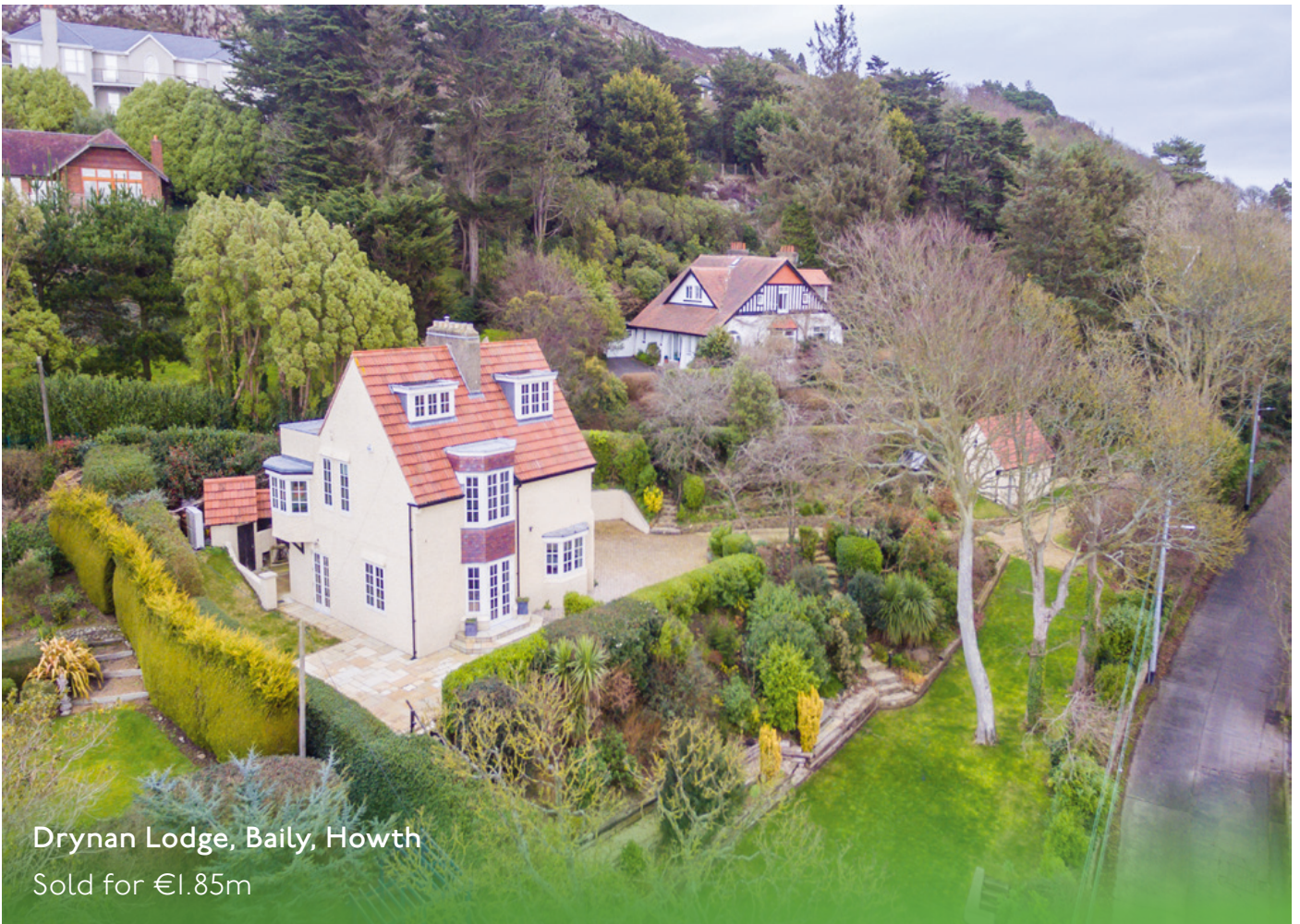
Drynan Lodge, Baily, Howth Sold for €1.85m

1 The mild cooling in house price inflation continued in Q2 with strong signs of stabilisation in Dublin market prices. There was also evidence of fewer sales completing. This follows several years of very strong price growth and activity levels. These recent market conditions reflect affordability concerns caused by the loan-to-income limits set by the Central Bank along with uncertainty over any potential economic fallout from Brexit.