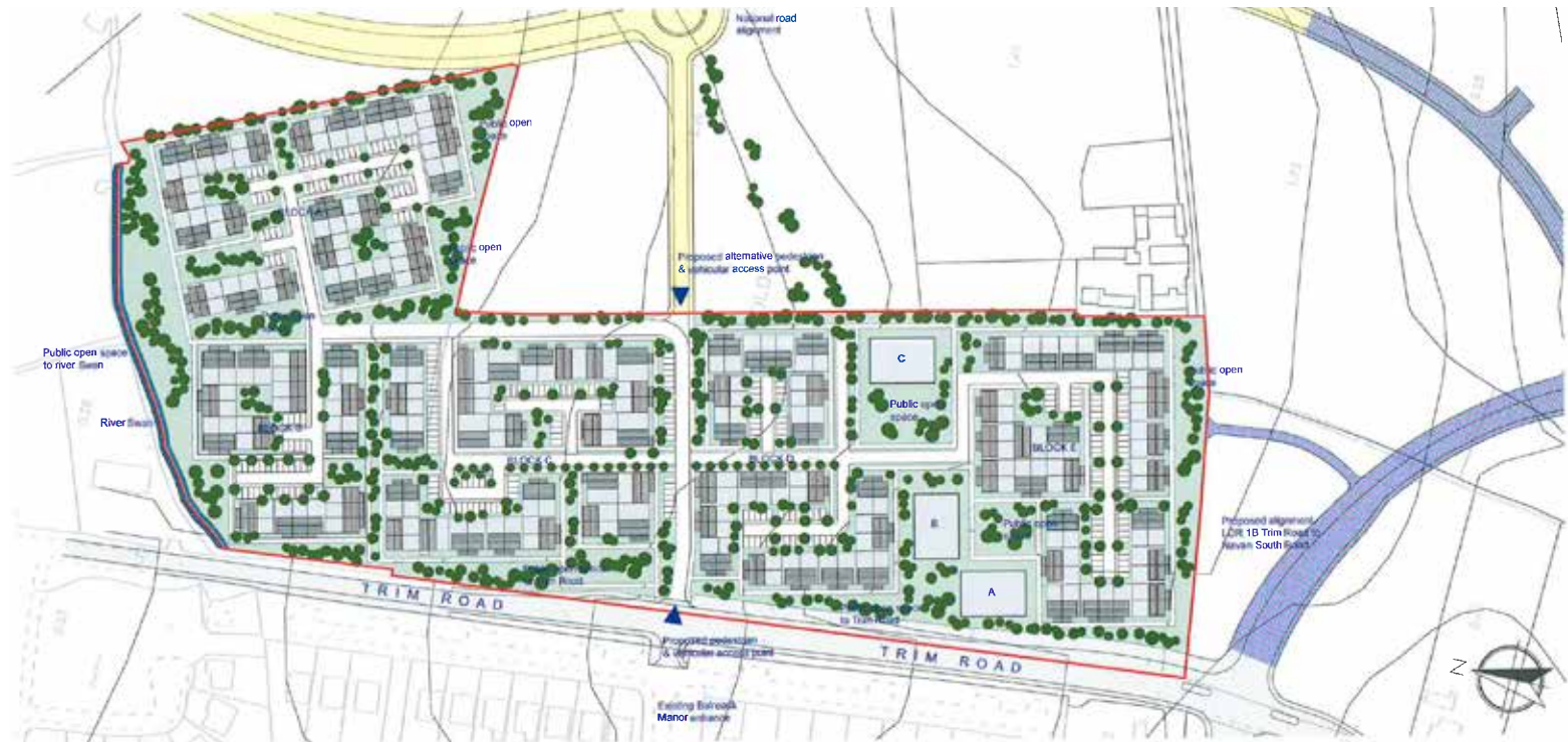
Proposed Site Plan - OPTION C NTS