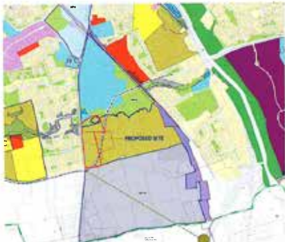
DETAIL - Navan Development Plan 2009 - 2015 6.39 Ha site Zoned A2 New Residential (Residential - Phase 2 (post 2019))