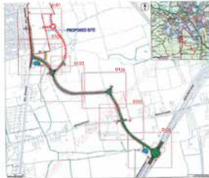
DETAIL - Proposed Alignment LDR 1B - Trim Rd to Navan South Rd