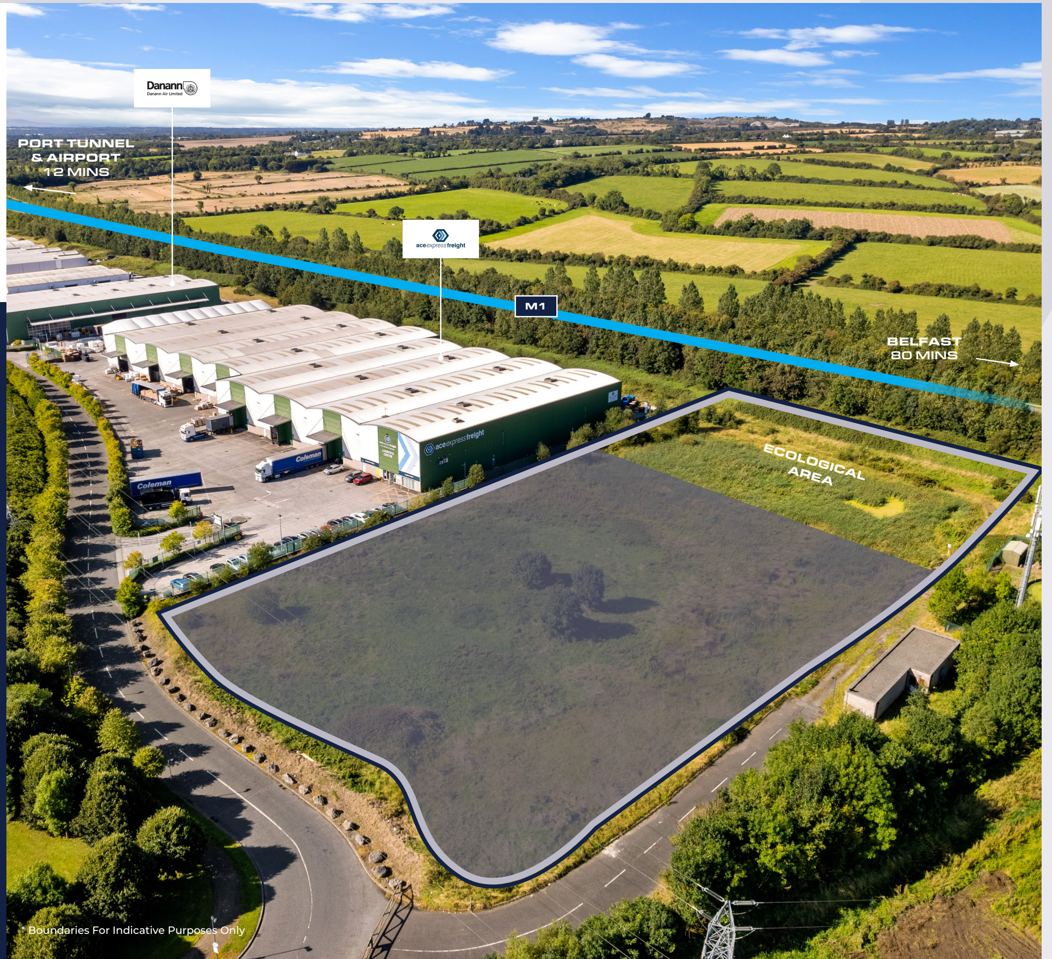
* Boundaries For Indicative Purposes Only