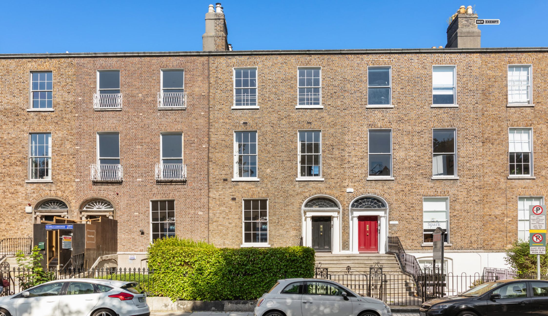
12 Herbert Place Dublin 2